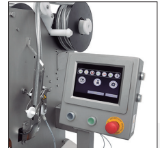
Accessory: Clip on spool for higher productions.