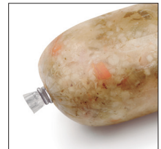
End of the sausage completely clean.