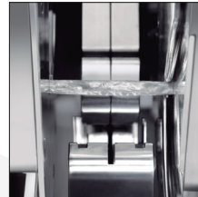
Clipper with voiding separators that cleans the end of the product.