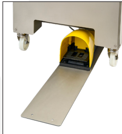
Safe and ergonomic foot pedal activation.