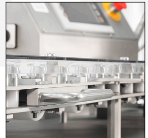
Possibility of remote assistance.