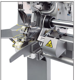
Filling tube's movement to ensure the clip is in the center of the sausage with a minimum effort.