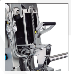
Semi-automatic operation of the machine.