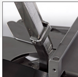
Clip adaptable to all types of bags, nets, and sacks.