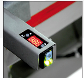
Automatic operation with maximum safety.