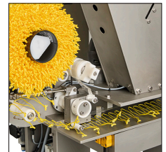
Automatic loop device.